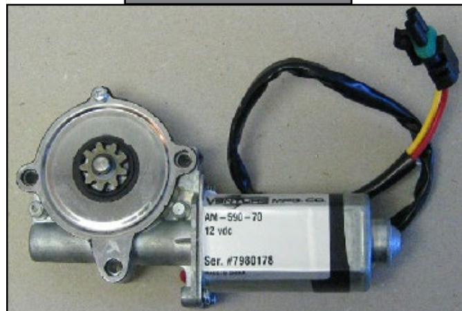
Fig. 3 - 163669 Motor