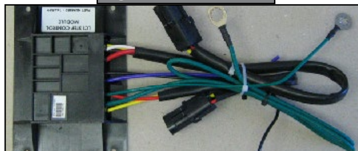
Fig. 4 - 164889 Module

As a supplier of components to the RV industry, safety, education and customer satisfaction are our primary concerns. Should you have any questions, please do not hesitate to contact us at (574) 537-8900 or by email at customerservice@lci1.com . Self-help tips, technical documents, product videos and a training class schedule are available at www.lci1.com or by downloading the MyLCI app.