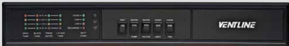
B Series Panel L9285